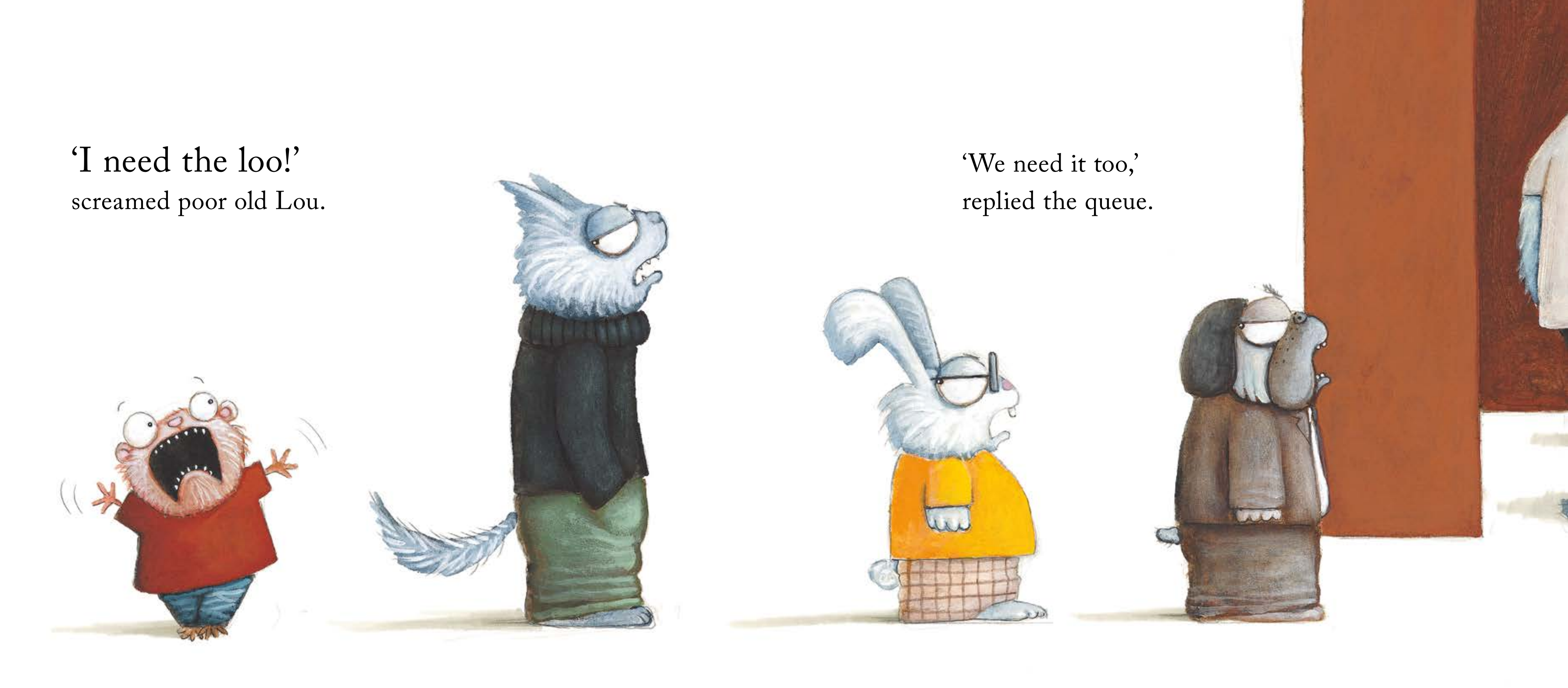
'I need it MORE!' cried Lou. 'I DO!'