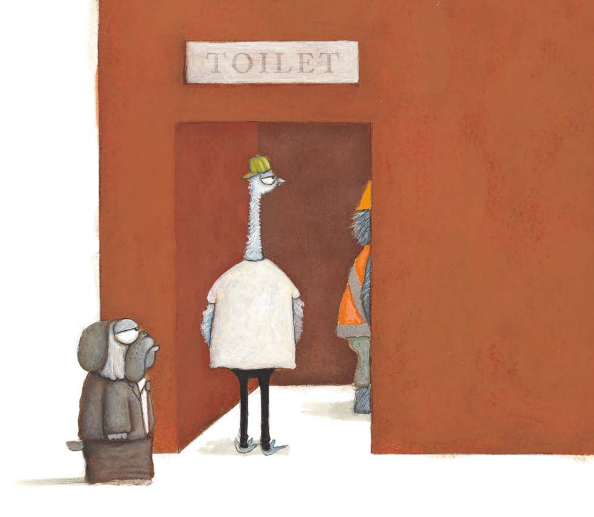
What on earth was Lou to do?