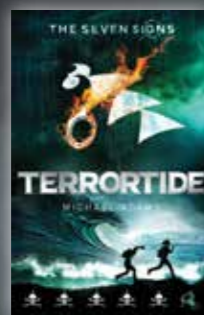
Book #6: Terrortide August 2017