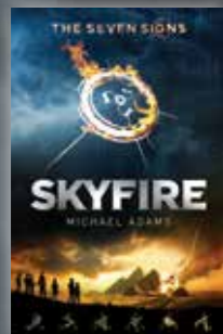
Book #1: Skyfire September 2016

7 books to be published within 13 months