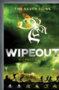
Book #3: Wipeout February 2017