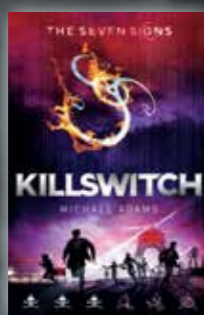
Book #4: Killswitch April 2017