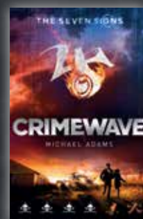
Book #5: Crimewave June 2017