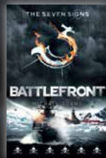
Book #7: Battlefront October 2017