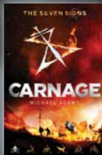
Book #2: Carnage November 2016